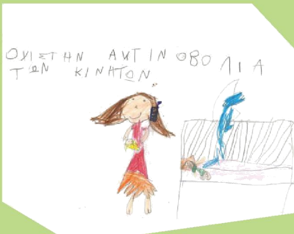
Myrsini Manitaki Loizou, 5,5 years old